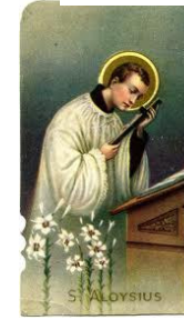
June 21 st St. Aloysius Gonzaga, Religious

Stress in your Marriage? – Retrouvaille is a program for married couples that feel bored, disillusioned, frustrated, or angry in their marriage. Some experience coldness. Others experience conflict in their relationship. Most don't know how to change the situation or even communicate with their spouse about it. This program has helped 10's of 1000's of couples experiencing difficulties in their marriage. For confidential information about or to register for the August program beginning with a weekend in Victoria on Aug 19-21 call 361-580-2770 or email: jbviov@sbcglobal.net or visit the website at www.Retrouvaille.org .