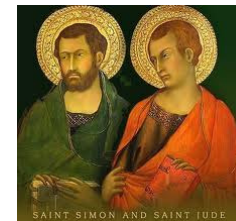
October 28 th , Sts. Simon and Jude, Apostles

Today's saint had a difficult, travel-filled life. Born in Spain (1807), he worked as a weaver before ordination in 1835. He preached in Spain and the Canary Isles and founded the Missionary Institute of Sons of the Immaculate heart of Mary (the Claretians). He became Archbishop of Santiago in Cuba (1850-1857) and Confessor to the Queen of Spain (1857-1867). Archbishop Anthony Claret was deeply interested in the Catholic Press and the First Vatican Council. Driven into exile in France, he died peacefully-after many trials and revolutions-in 1870. He was canonized a saint in 1950.